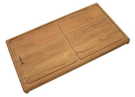
Iroko-wood sliding chopping board 8643 000