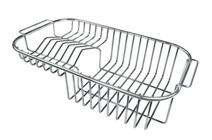
Stainless steel plate rack 8100 301