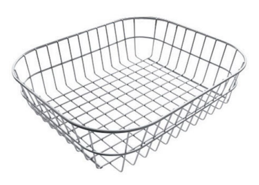
Stainless steel basket 8611 000