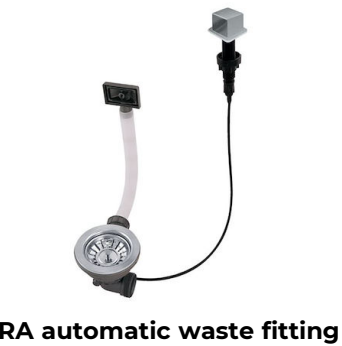
LIRA automatic waste fitting 8407 103